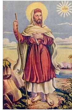
St. John de Britto (1647-1693) Martyr of India Feast Day, February 4